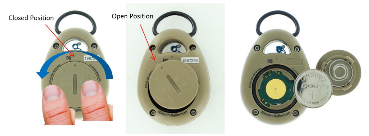
Figure 2: Battery Replacement